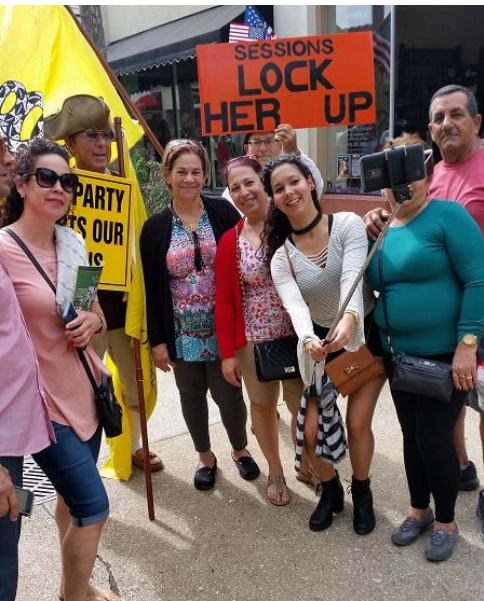
by Communists from Flagler College. Student’s application of “Political Correctness” to a Halloween costume Aunt Jemima was mind blowing. Flagler College is located just a few blocks away.