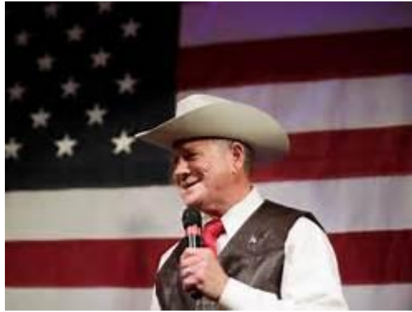
Roy Moore FB Image

Alabama Republican Senate candidate Roy Moore is on the hot-seat because 40 years ago, as a young bachelor in his early thirties, it is alleged he was interested in dating several teenage girls, the youngest of whom was fourteen at the time. Moore isn't accused of any egregious sexual misconduct with them. Nevertheless, it is to wonder what he was thinking. Perhaps he was a late bloomer, basically shy around the opposite sex, not able to connect with women his own age.