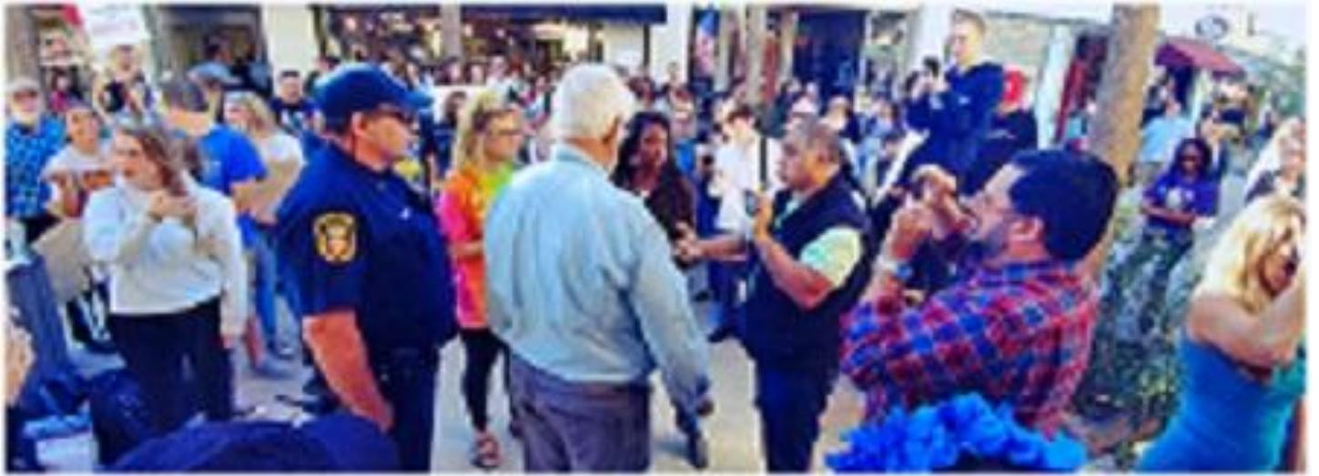
Bunnery Restaurant 10-31-17

According to the story filed by the St. Augustine Record, this was a student demonstration. The St. Augustine Record has a long history of failing to report important details regarding political demonstrations.